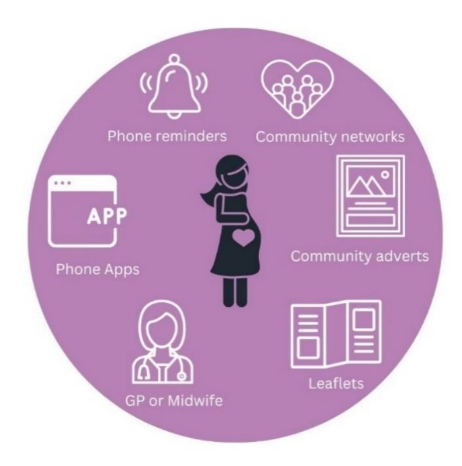
Figure 2: How women want to be communicated with.

How do women want to be communicated with?